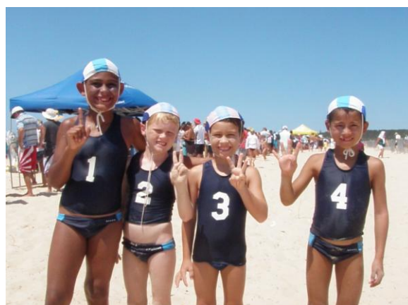
UNDER 8's above, UNDER 14's below