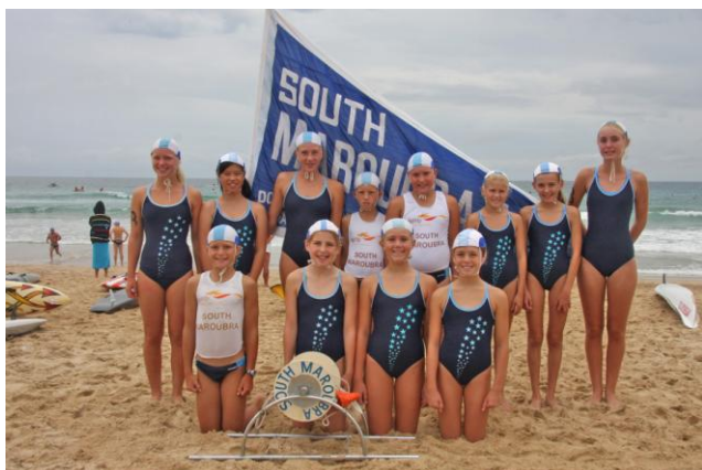
South Maroubra March Past Team - Branch

South Maroubra placed 12 th in the overall pointscore which is an outstanding result considering the total membership of our club and the small team that we sent to State. I congratulate each and every one of the children on their efforts. Special thanks to the Team Managers, Coaches, Captains and parents for making the weekend such a memorable occasion.